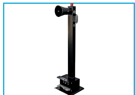
MOBILE WIRED CONTROL UNIT