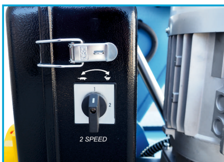
TWO SPEEDS OF THE HEAD