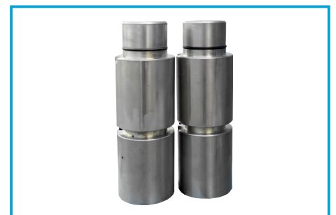
ADDITIONAL HEIGHT ADAPTERS