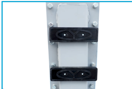
SET OF DOOR PROTECTION